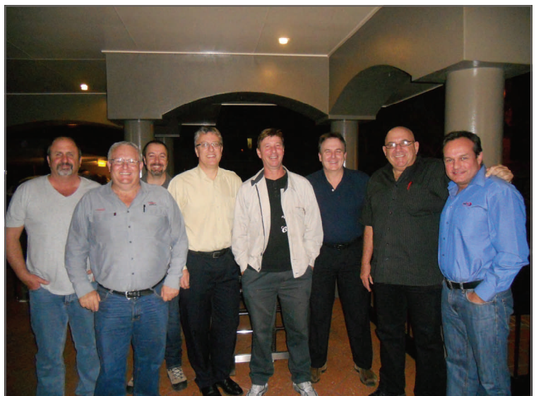
General Managers at a recent Meeting in Mackay